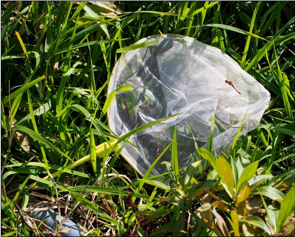
Figure 4 Butterfly net such as commonly used by children to catch insects, found in Sapporo IGS.