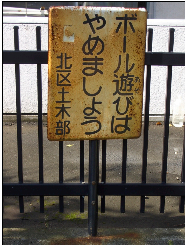
Figure 1 Sign restricting ball play in public greenspace (Sapporo, Japan). Translation of sign: “Let’s refrain from ball play. –Kita Ward Civil Engineering Department”

To circumvent these restrictions, young people may seek out less controlled spaces, (e.g. vacant lots, river banks and other ‘informal greenspaces’ (IGS). Freedom from purpose makes these spaces malleable (Cloke and Jones 2005). Children and teenagers value such spaces (Berg and Medrich 1980; Elsley 2004; Mugford 2012; Schneekloth 2007). Scholars argue these spaces can offer excitement, provide opportunities for exploration, escape from adult supervision, and a sense of ownership (Carr and Lynch 1968; Donnelly 1980; Nohl 1990). But children and teenagers today seem less free in choosing how and where to spend their time; their contact with nature, and especially their use of IGS may be limited by increased parental concern for safety (Valentine and McKendrick 1997). Vacant lots are less commonly available, and are increasingly hard to access (Hayashi, Tashiro, and Kinoshita 1999). This begs the question: how widely did previous generations use IGS as children and teenagers? To what degree are young people today deprived of using greenspace types they have been taught to avoid – what Louv calls a ‘nature deficit syndrome’ (2008)? Five important